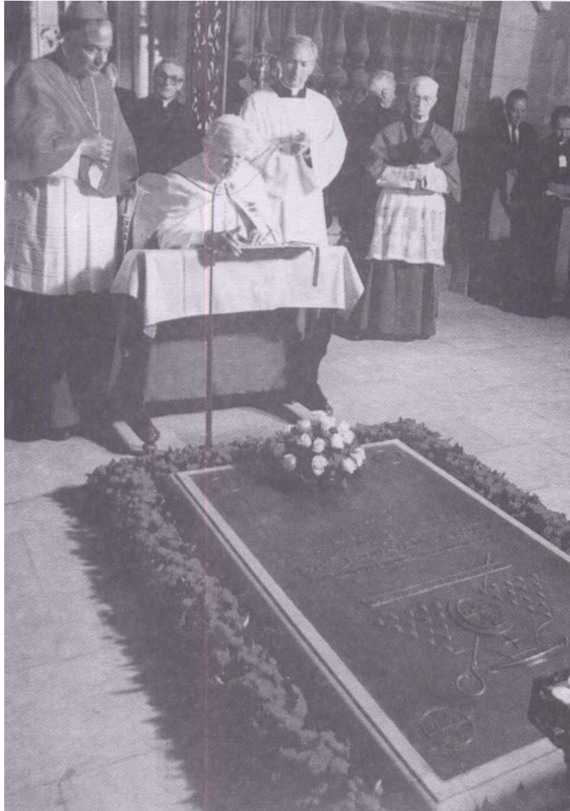
Photograph of Pope John Paul II praying at Cardinal von Galen's tomb, 1 st May 1987